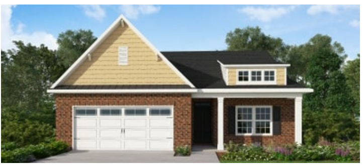
Full Brick Elevation