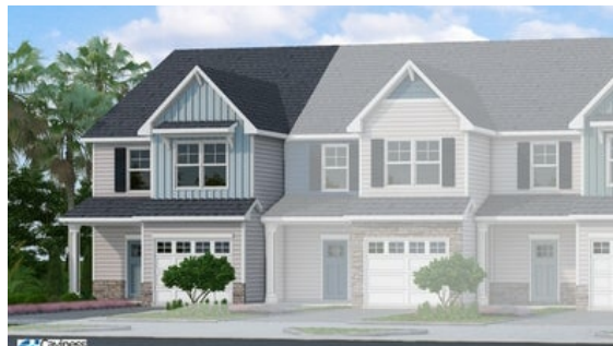
End Unit with Board & Batten