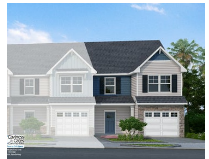
End Unit with Shake