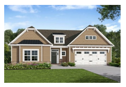
Elevation B Elevation C Elevation D

Prices, plans, dimensions, features, specifications, materials, and availability of homes or communities are subject to change without notice or obligation. Illustrations are artists depictions only and may differ from completed improvements. All prices subject to change without notice. Please contact your sales associate before writing an offer.