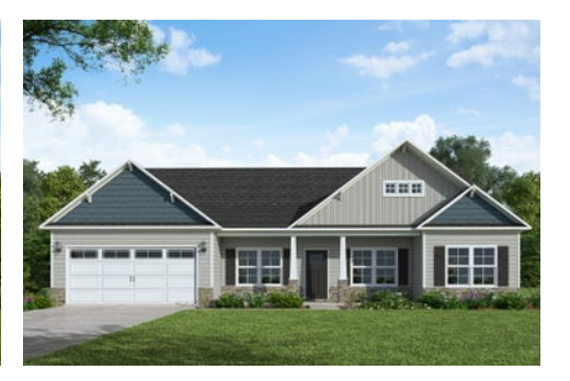
Elevation B Elevation C Elevation D

Prices, plans, dimensions, features, specifications, materials, and availability of homes or communities are subject to change without notice or obligation. Illustrations are artists depictions only and may differ from completed improvements. All prices subject to change without notice. Please contact your sales associate before writing an offer.