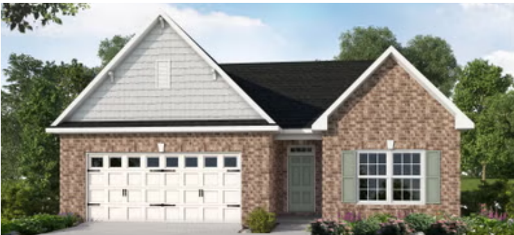
Full Brick Elevation