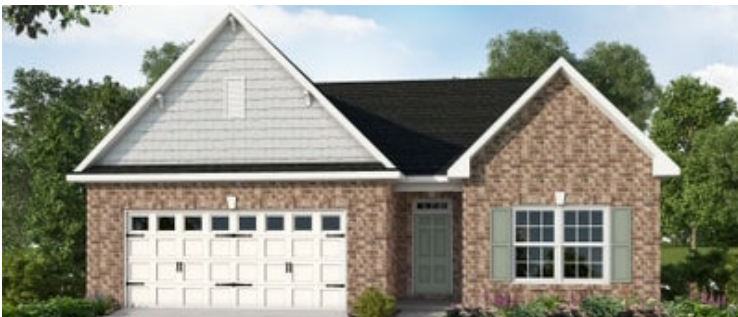
Full Brick Elevation