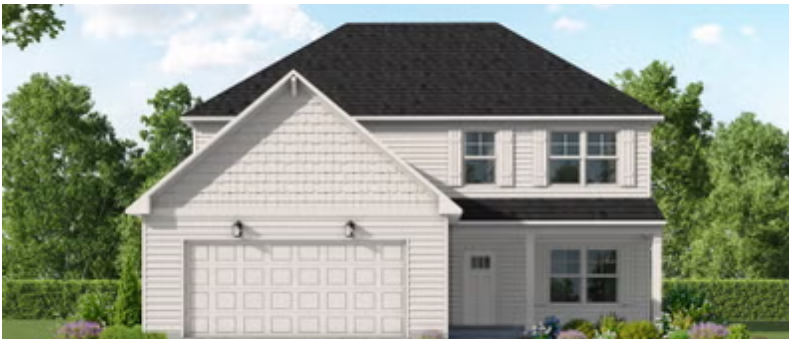
Embark Collection-Elevation A