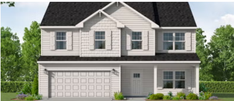
Elevation A-Embark Collection