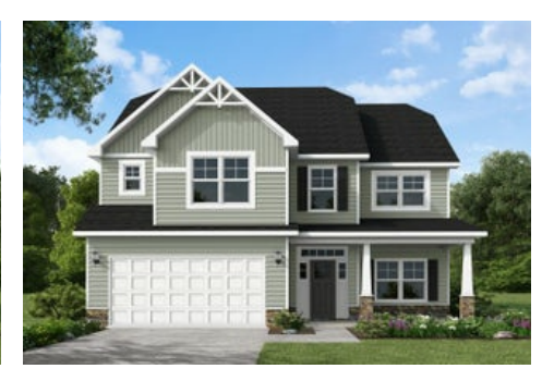
Elevation B Elevation C Elevation E

Prices, plans, dimensions, features, specifications, materials, and availability of homes or communities are subject to change without notice or obligation. Illustrations are artists depictions only and may differ from completed improvements. All prices subject to change without notice. Please contact your sales associate before writing an offer.