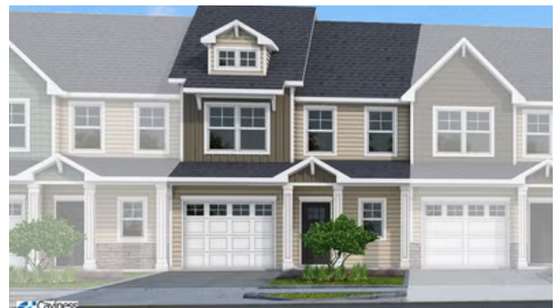
Middle Unit with Board & Batten