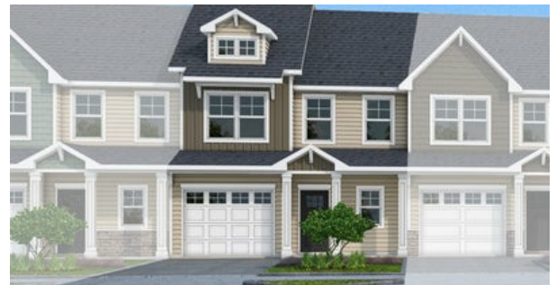
Middle Unit with Board & Batten