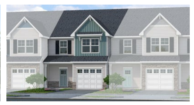
Middle Unit with Board & Batten