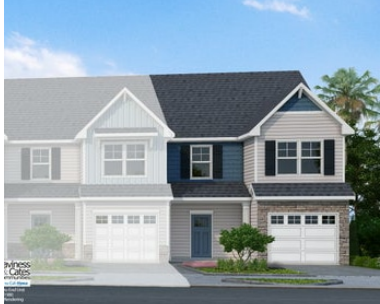
End Unit with Shake