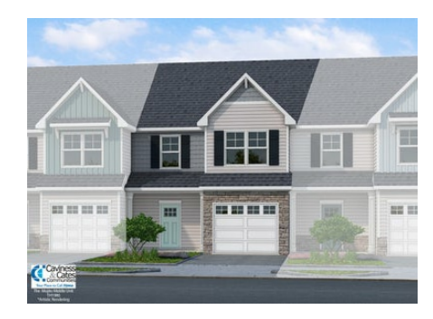
Middle Unit with Shake