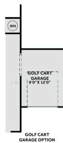
GOLF CART GARAGE OPTION