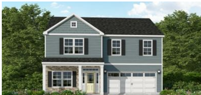
Elevation B with Brick