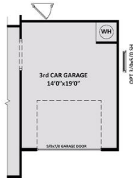
3RD CAR GARAGE OPTION