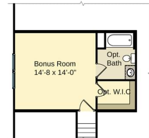
Second Floor Plan 1/4" = 1'-0" (OPTIONAL BONUS w/ BATH)

Prices, plans, dimensions, features, specifications, materials, and availability of homes or communities are subject to change without notice or obligation. Illustrations are artists depictions only and may differ from completed improvements. All prices subject to change without notice. Please contact your sales associate before writing an offer.