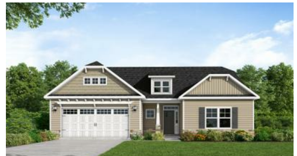
Elevation D with Dutch Hips