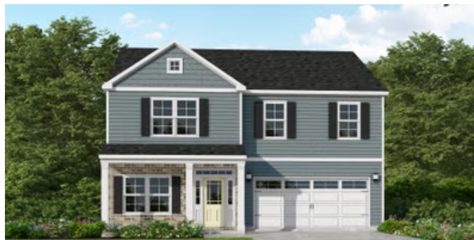
Elevation B with Brick