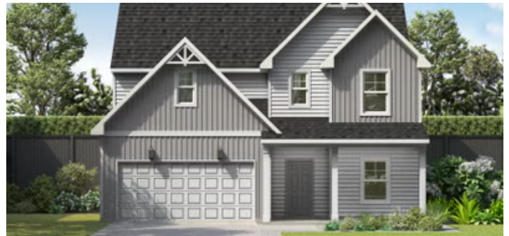
Embark Collection-Elevation F