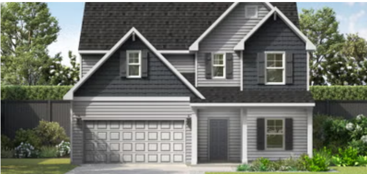
Embark Collection-Elevation A