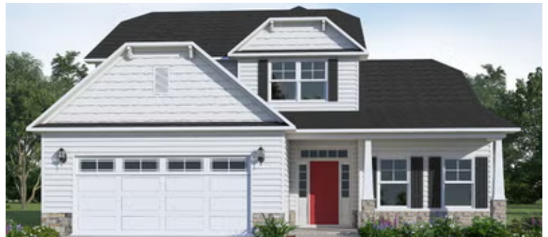
Elevation C with Dutch Hips