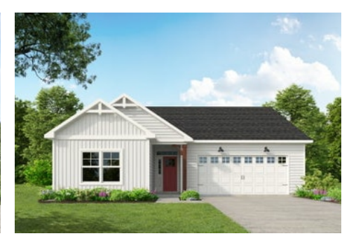
Elevation B Elevation C Elevation F

Prices, plans, dimensions, features, specifications, materials, and availability of homes or communities are subject to change without notice or obligation. Illustrations are artists depictions only and may differ from completed improvements. All prices subject to change without notice. Please contact your sales associate before writing an offer.