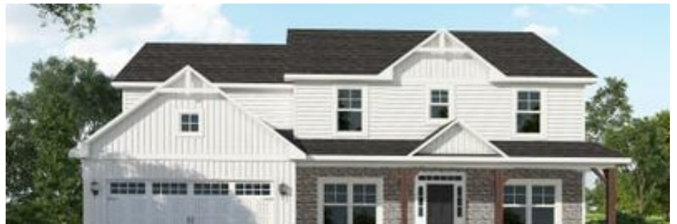
Elevation F with Stone