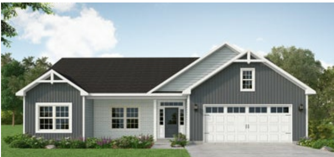
Elevation F with Brick