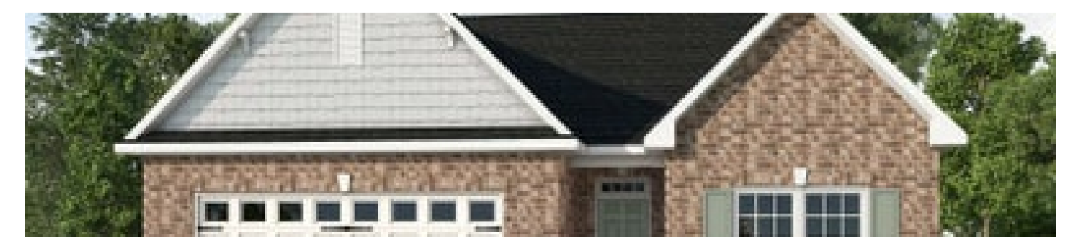
Full Brick Elevation