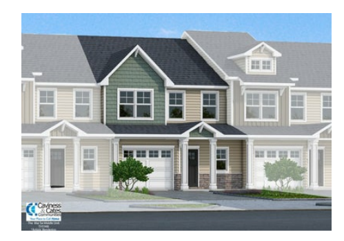
Middle Unit with Shake