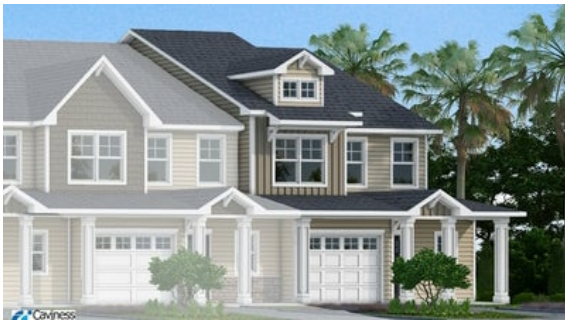
End Unit with Board & Batten