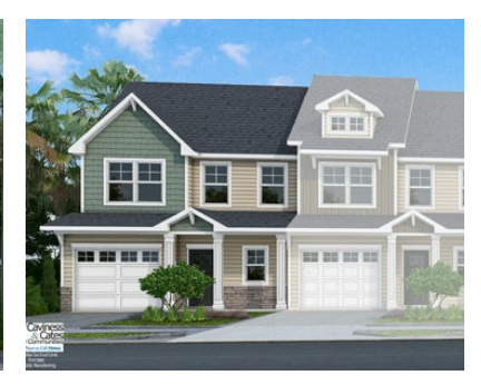
End Unit with Shake