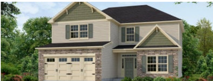
ARCHIVED 1/13/2023 - Elevation B