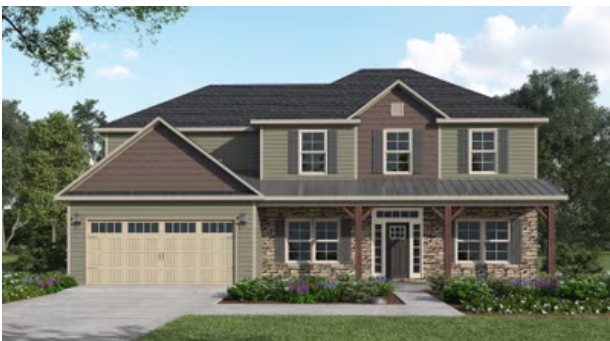
ARCHIVED 07/07/2022 - Elevation B