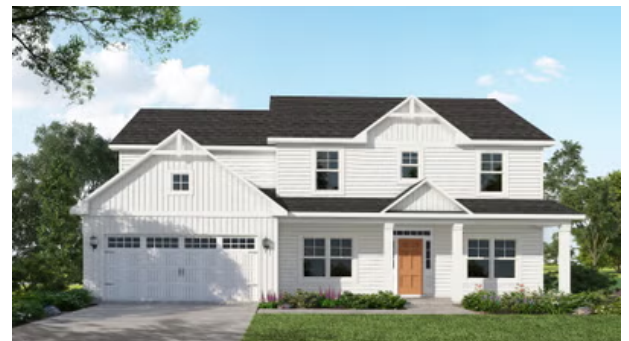
ARCHIVED 07/07/2022 - Elevation F