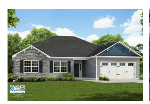
ARCHIVED 07/08/2022 -Elevation B