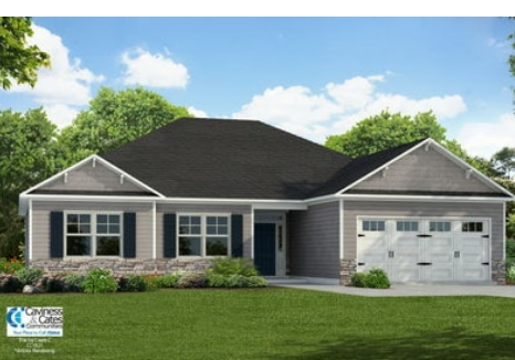
ARCHIVED 07/08/2022 - Elevation C