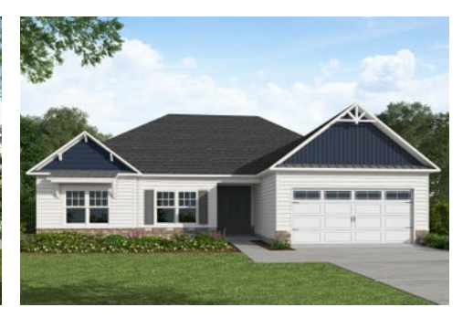
ARCHIVED 07/08/2022 -Elevation E

Prices, plans, dimensions, features, specifications, materials, and availability of homes or communities are subject to change without notice or obligation. Illustrations are artists depictions only and may differ from completed improvements. All prices subject to change without notice. Please contact your sales associate before writing an offer.