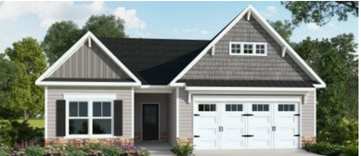
Elevation TW- ARCHIVED 2/8/2023