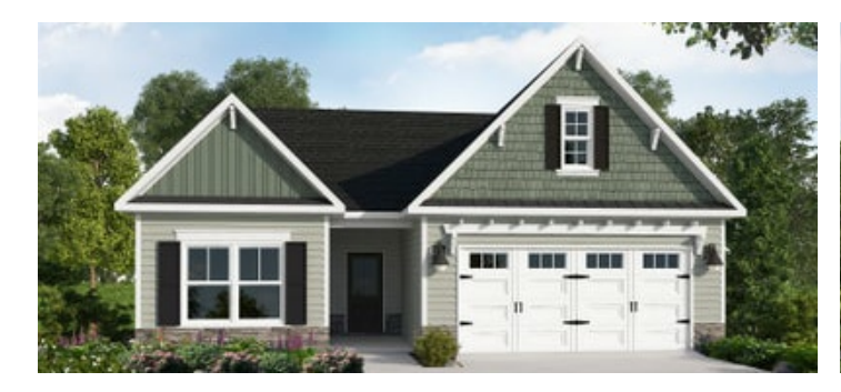
Elevation C - ARCHIVED 2/8/2023