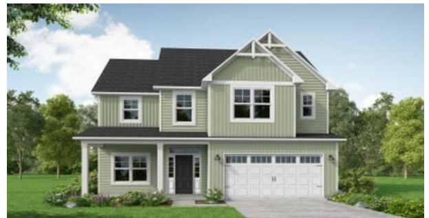
ARCHIVED 7/06/2022 - Elevation F