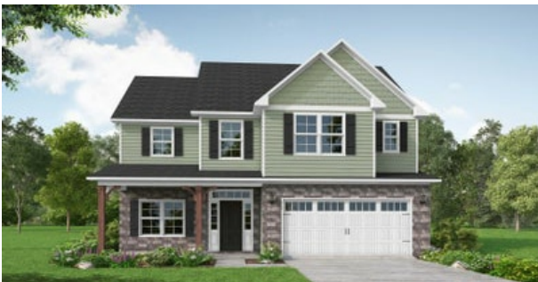
ARCHIVED 7/06/2022 - Elevation B