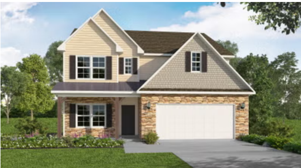
ARCHIVED 07/07/2022 - Elevation B