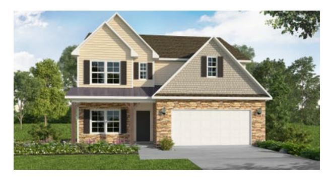
ARCHIVED 07/07/2022 - Elevation B