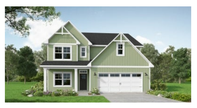
ARCHIVED 07/07/2022 - Elevation F