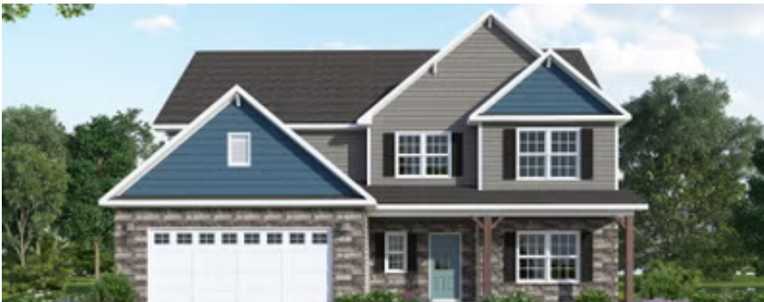
ARCHIVED 07/07/2022 - Elevation B