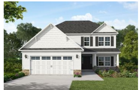
ARCHIVED 07/07/2022 - Elevation D