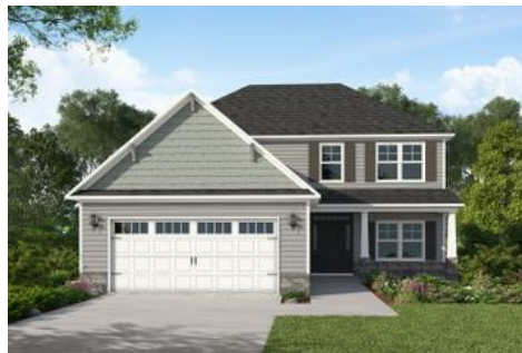
ARCHIVED 07/07/2022 - Elevation C