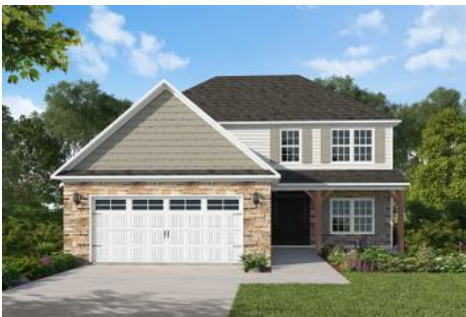
ARCHIVED 07/07/2022 - Elevation B