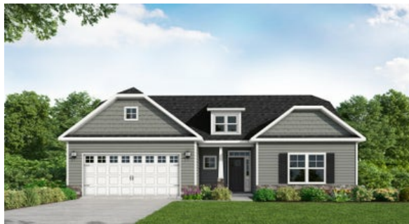
Elevation C with Dutch Hips