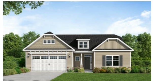
Elevation D with Dutch Hips