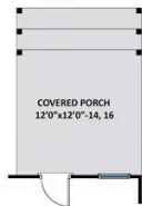
REAR COVERED PORCH OPTION