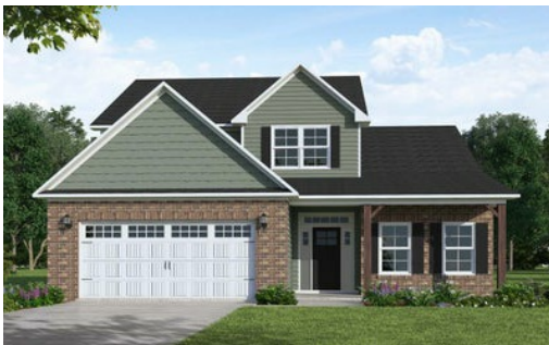
ARCHIVED 7/06/2022 - Elevation B