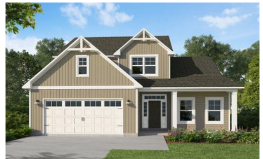
ARCHIVED 7/06/2022 - Elevation F