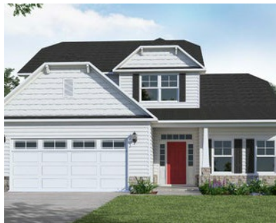
Elevation C with Dutch Hips