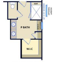
PRIMARY BATH OPTION 2