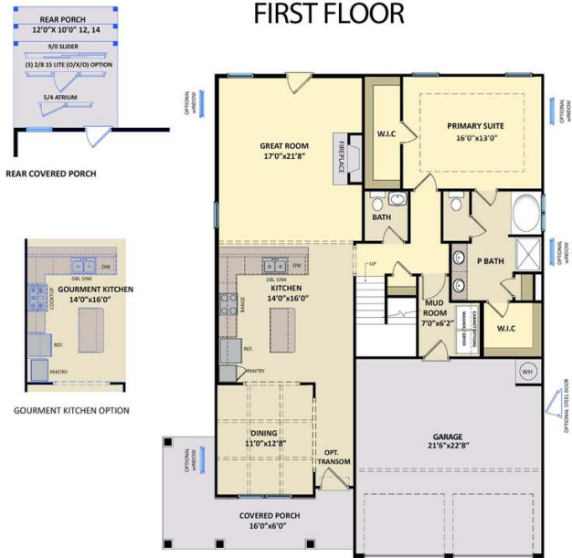
REAR COVERED PORCH