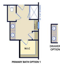
PRIMARY BATH OPTION 1