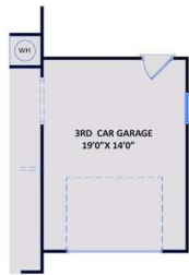
3RD CAR GARAGE