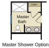
Master Shower Option