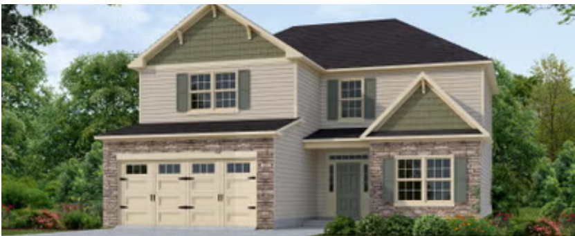
ARCHIVED 1/13/2023 - Elevation B