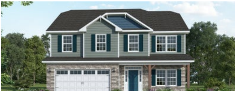
Elevation B - ARCHIVED 3/29/23