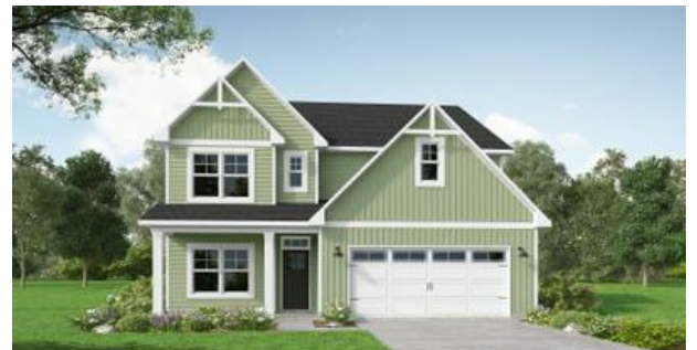
ARCHIVED 07/07/2022 - Elevation F