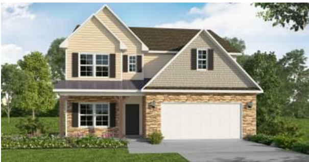
ARCHIVED 07/07/2022 - Elevation B