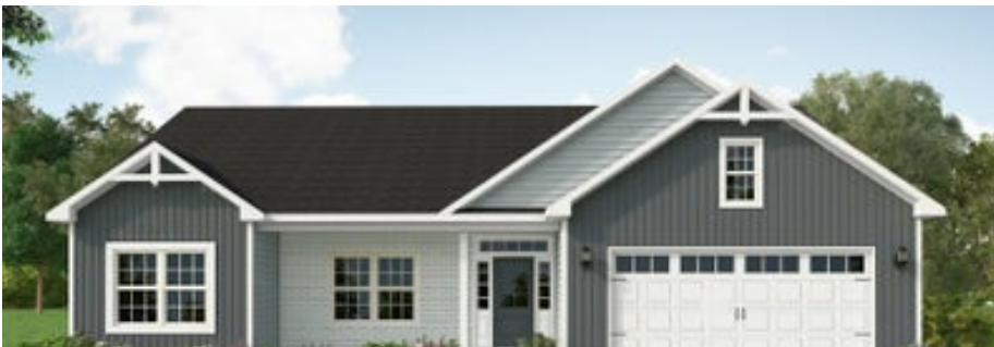
Elevation F with Brick