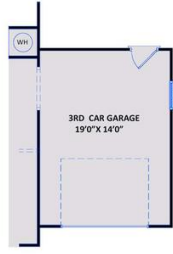
3RD CAR GARAGE