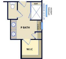
PRIMARY BATH OPTION 2