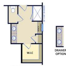
PRIMARY BATH OPTION 1