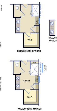
PRIMARY BATH OPTION 1