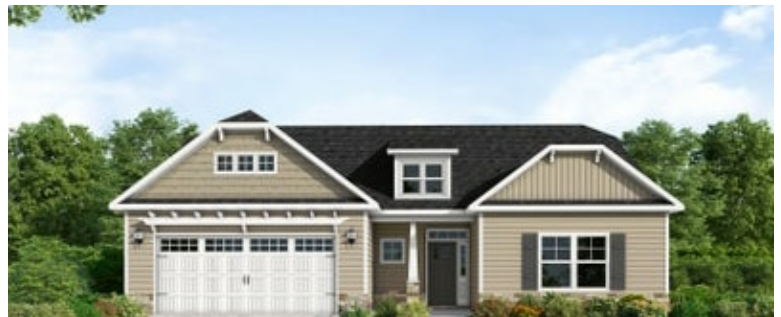
Elevation D with Dutch Hips