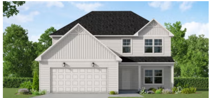
Embark Collection-Elevation F