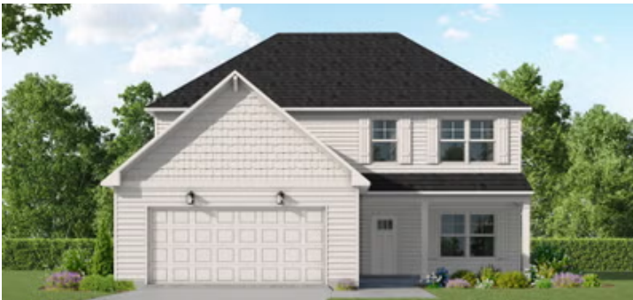
Embark Collection-Elevation A