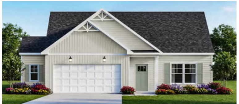
Elevation F with Work Area

Prices, plans, dimensions, features, specifications, materials, and availability of homes or communities are subject to change without notice or obligation. Illustrations are artists depictions only and may differ from completed improvements. All prices subject to change without notice. Please contact your sales associate before writing an offer.