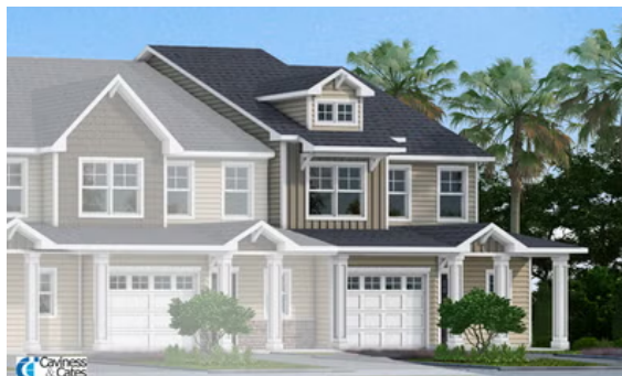
End Unit with Board & Batten