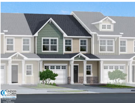
Middle Unit with Shake