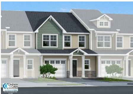
Middle Unit with Shake