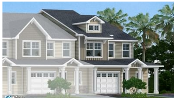
End Unit with Board & Batten