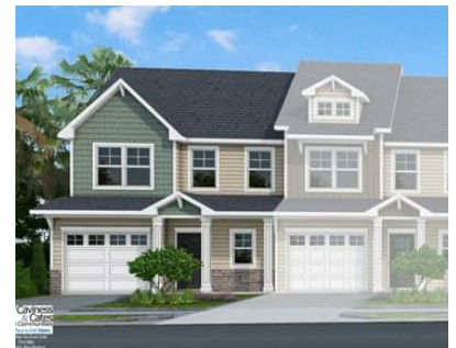
End Unit with Shake

Prices, plans, dimensions, features, specifications, materials, and availability of homes or communities are subject to change without notice or obligation. Illustrations are artists depictions only and may differ from completed improvements. All prices subject to change without notice. Please contact your sales associate before writing an offer.