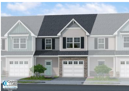
Middle Unit with Shake