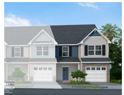
End Unit with Shake