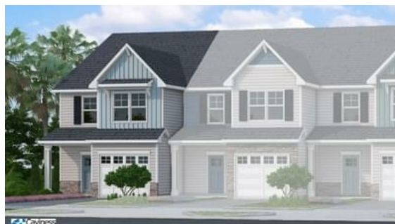
End Unit with Board & Batten